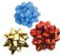
Ribbons and Bows