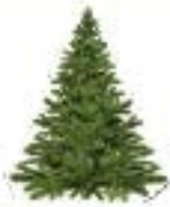
Fresh Trees, Wreaths, & Garland Mountain True Jackson Park Event