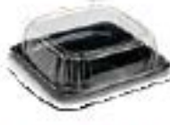
Plastic Trays and Lids