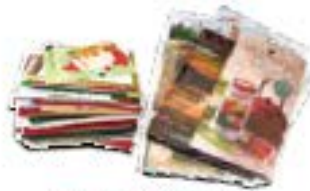
Cards, Envelopes, & Catalogs