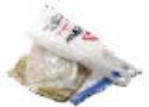
Plastic Bags & Plastic Wrap Grocery and Retail Stores