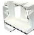
Foam Packaging Hard to Recycle Event