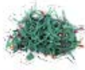
Light Strings Henderson County 4H Club or Convenience Center