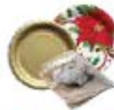
Paper Plates, Towels, & Napkins