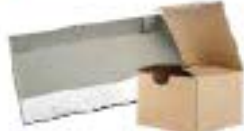
Plain Gift Boxes