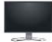
TV and Computer Monitors Transfer Station