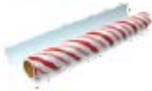
Plain Gift Wrap