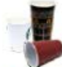
Paper and Plastic Cups