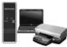
Electronics Convenience Center