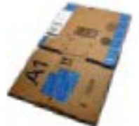
Cardboard Flattened Boxes