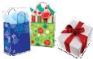
Gift Bags and Boxes